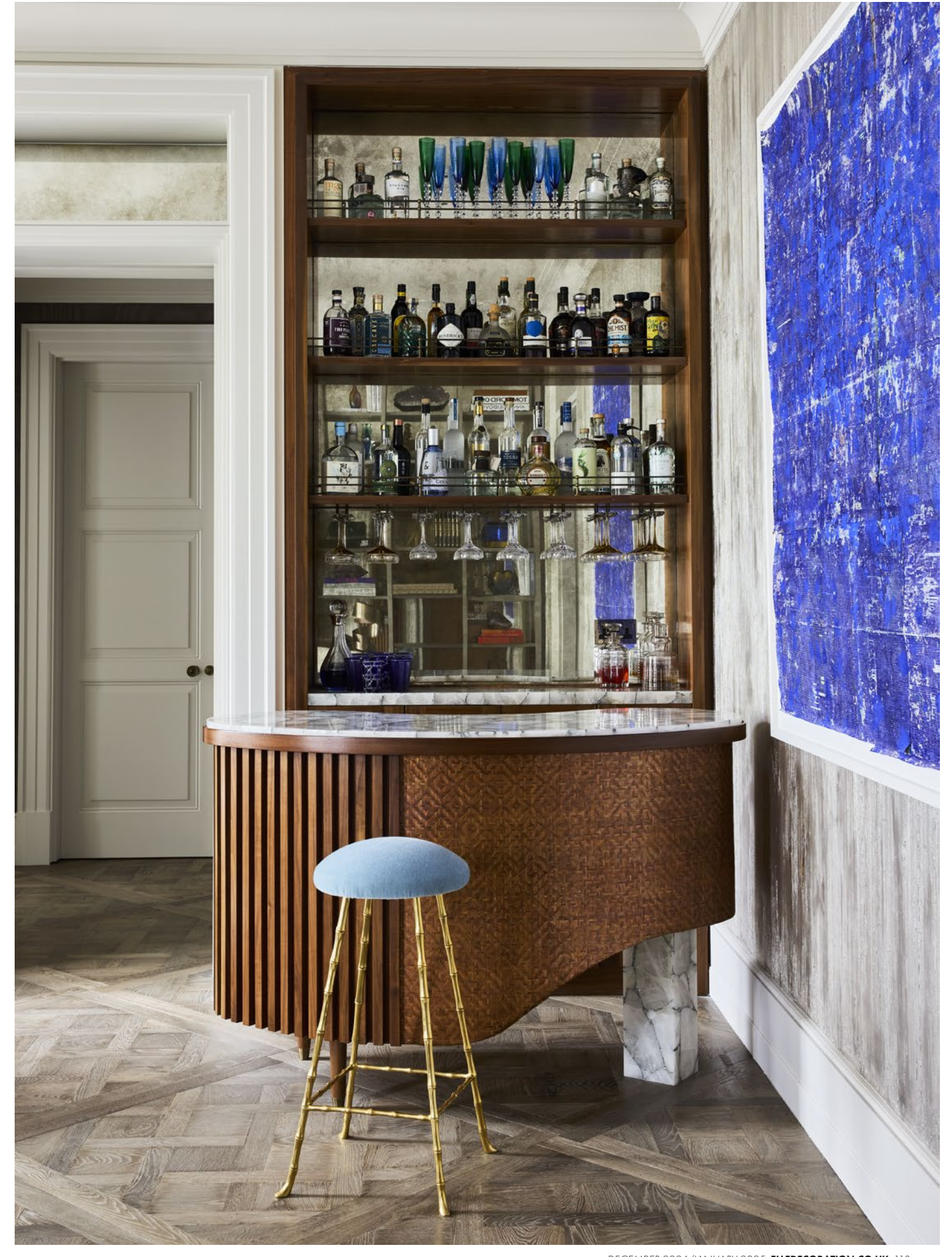
DECEMBER 2024/JANUARY 2025 ELLEDECORATION.CO.UK 113