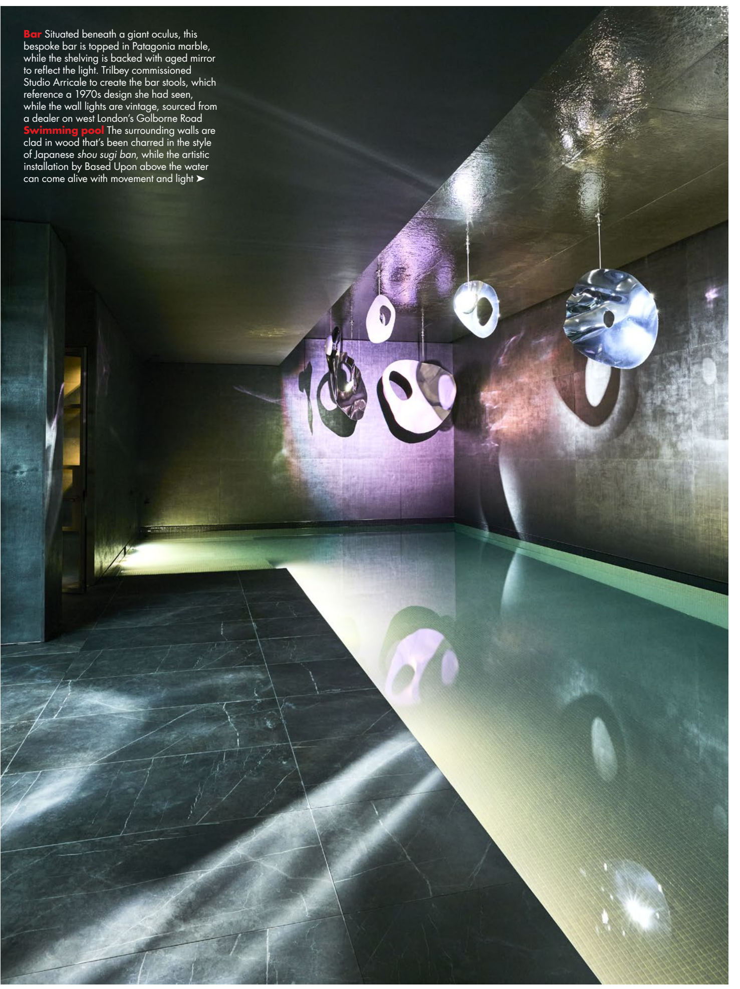
DECEMBER 2024/JANUARY 2025 ELLEDECORATION.CO.UK 119